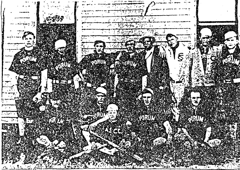
MEMBERS OF THE PORUM BASEBALL TEAM

CAN YOU IDENTIFY ANYONE PERSON IN THE ABOVE PICTURE. WOULD LIKE TO KNOW THE DATE IT WAS TAKEN.